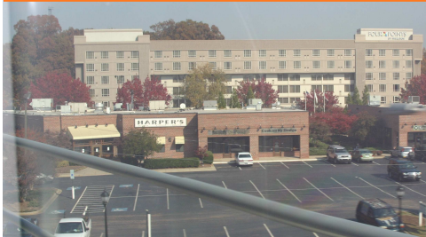
View from Light Rail Train